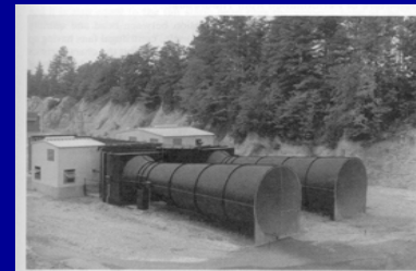
FIGURE 9.4 Axial-flow fans, model 8HU117, dual installation. (By permission from Jeffrey Mining Machinery Division, Dresser Industries, Inc., Columbus, OH).